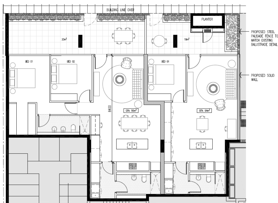
Figure 4 Anticipated Apartment Layout

Figure 2 illustrates the potential layout of two apartments prepared by SJB Architects. The configuration will allow for 1 x one bedroom unit and 1 x two bedroom unit. The indicative layout demonstrates that each unit will achieve natural light and will be afforded a functional floor layout with direct access to a private courtyard.